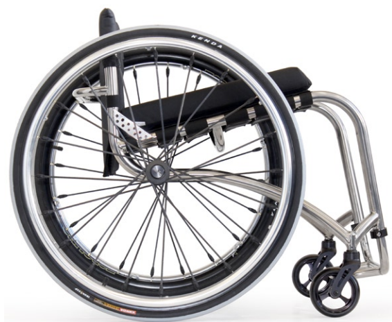
Scorpion with Carbon Fibre Topolino Wheels